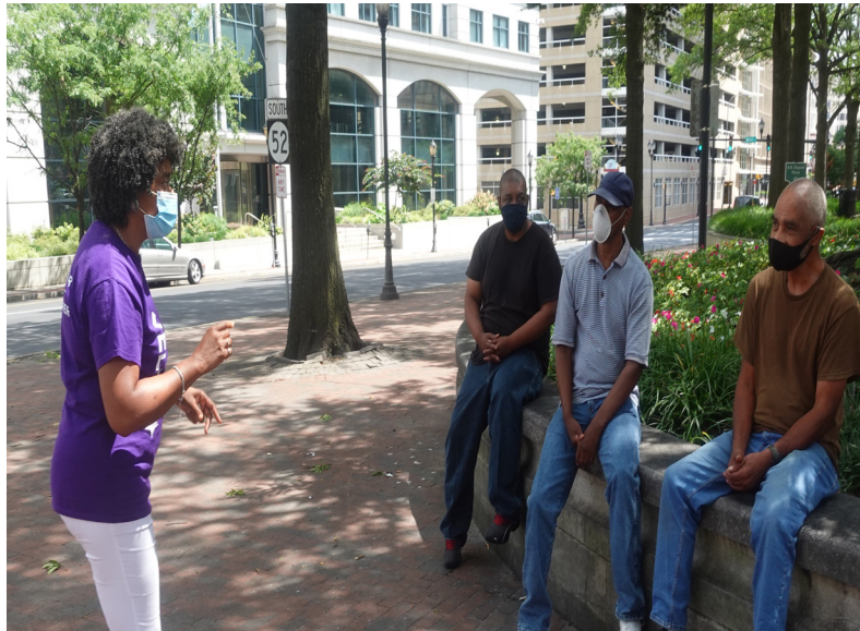
Constituents share concerns about lack of jobs and affordable housing.